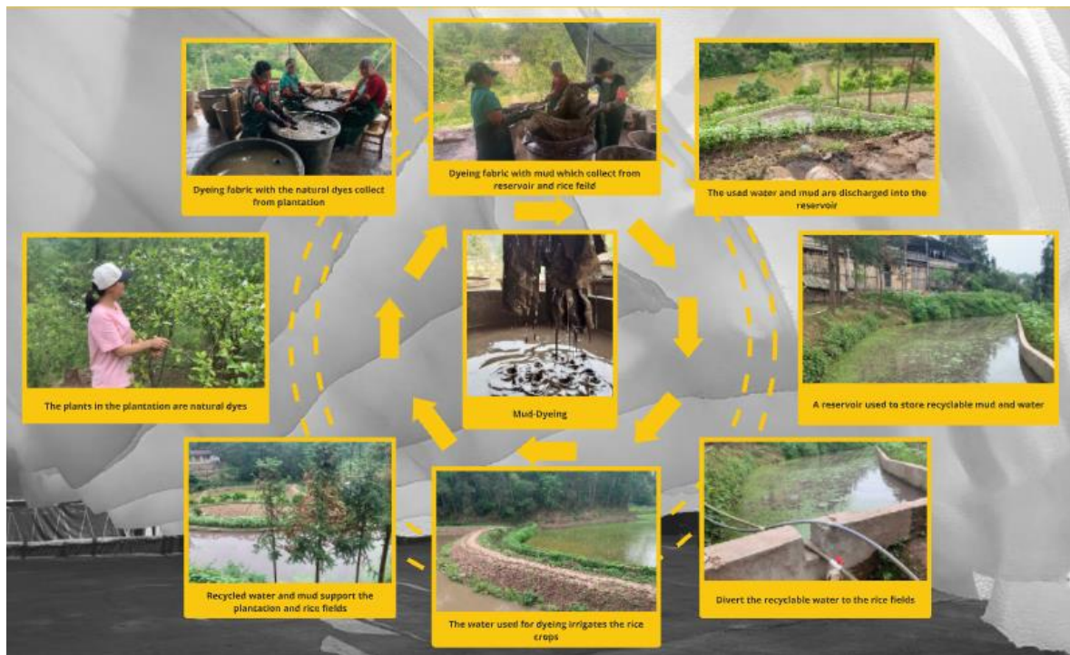
Fig 4. Yan Feng (no date) Schematic of Xiang's Studio's closed loop system.