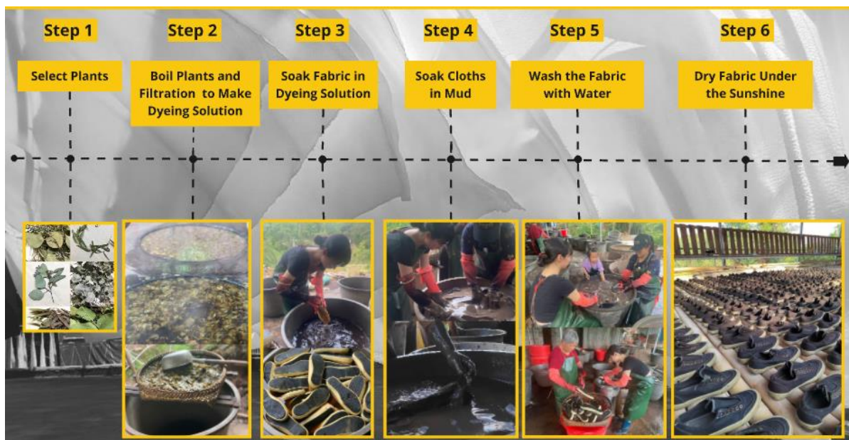
Fig 3. Yan Feng (no date) Mud-dyeing Process Flowchart

the materials over time. To address this, multiple site visits and follow-up interviews were conducted to track how the mud’s properties evolved with each reuse, thereby adding reliability to the observations. After dyeing, fabrics are immersed in the mud for several hours to absorb pigments fully, followed by thorough washing and drying. Xiang’s commitment to ecological conservation through local materials and traditional knowledge illustrates the viability of mud-dyeing as a sustainable alternative to industrial dyeing processes, reinforcing its relevance in modern sustainable design. Reflecting on the limitations, the study encountered challenges in documenting all variables within Xiang’s natural and seasonal cycles, such as variations in mud properties due to weather changes. These factors, while difficult to control, add authenticity to the findings and emphasize the importance of localized environmental factors in sustainable craft practices. This investigation into Xiang’s mud-dyeing methods underscores how traditional crafts can be reimagined to align with global sustainability goals, preserving both environmental health and cultural heritage (Xiang, 2024). Fig 3 displays the basic progress of mud-dyeing in Xiang’s studio.